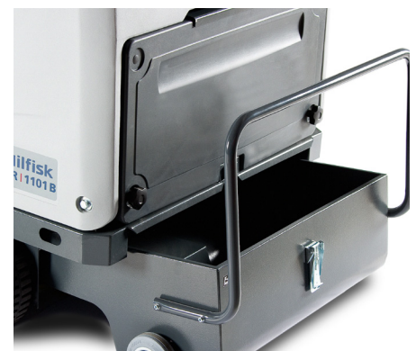
The hopper capacity is extremely large to extend operational time